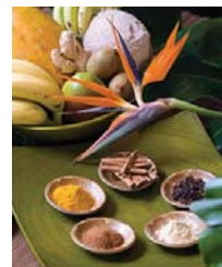
YOUR LAST RESORT From top: Spices and scrubs at the Island Hotel's super spa; the Ritz-Carlton's Dana Point beach view; water rains inside the Ritz's spa; the St. Regis Monarch Beach.